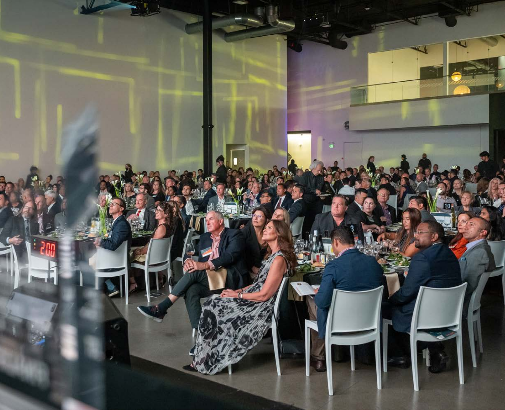
Table Supporting Sponsor